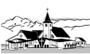
Edison Lutheran Church