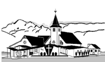
Edison Lutheran Church